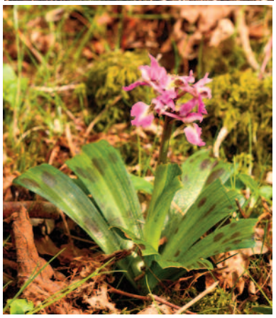
Fig. 1: Heavy browse on emergent Orchis mascula rosette and spike (top) and survival of remnant flowers all of which set fruit (bottom).