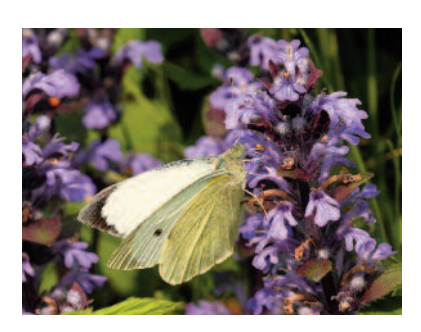
Fig. 3: Small White butterfly taking nectar from Bugle ( Ajuga reptans )